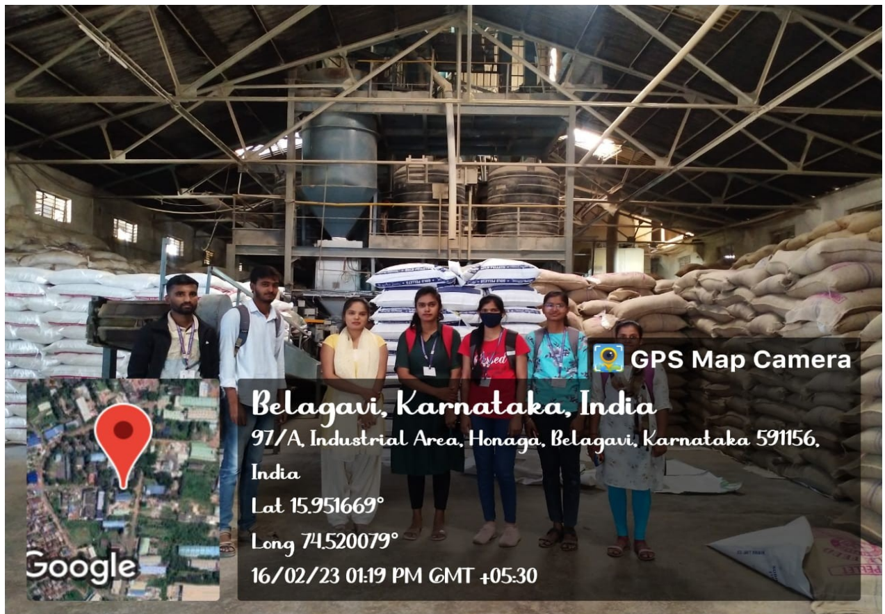
Students conducting survey in Medium enterprises