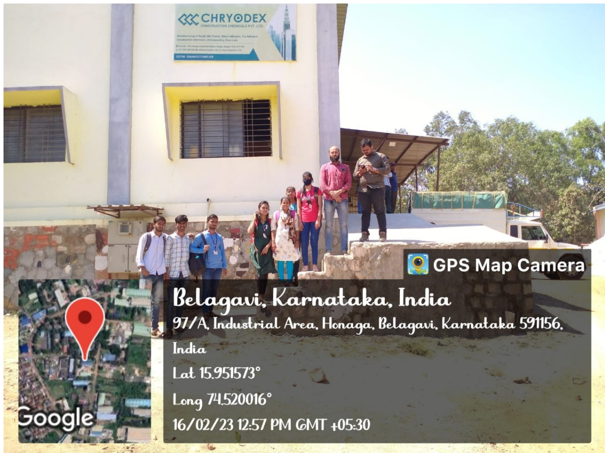
Students conducting survey on Labour problems