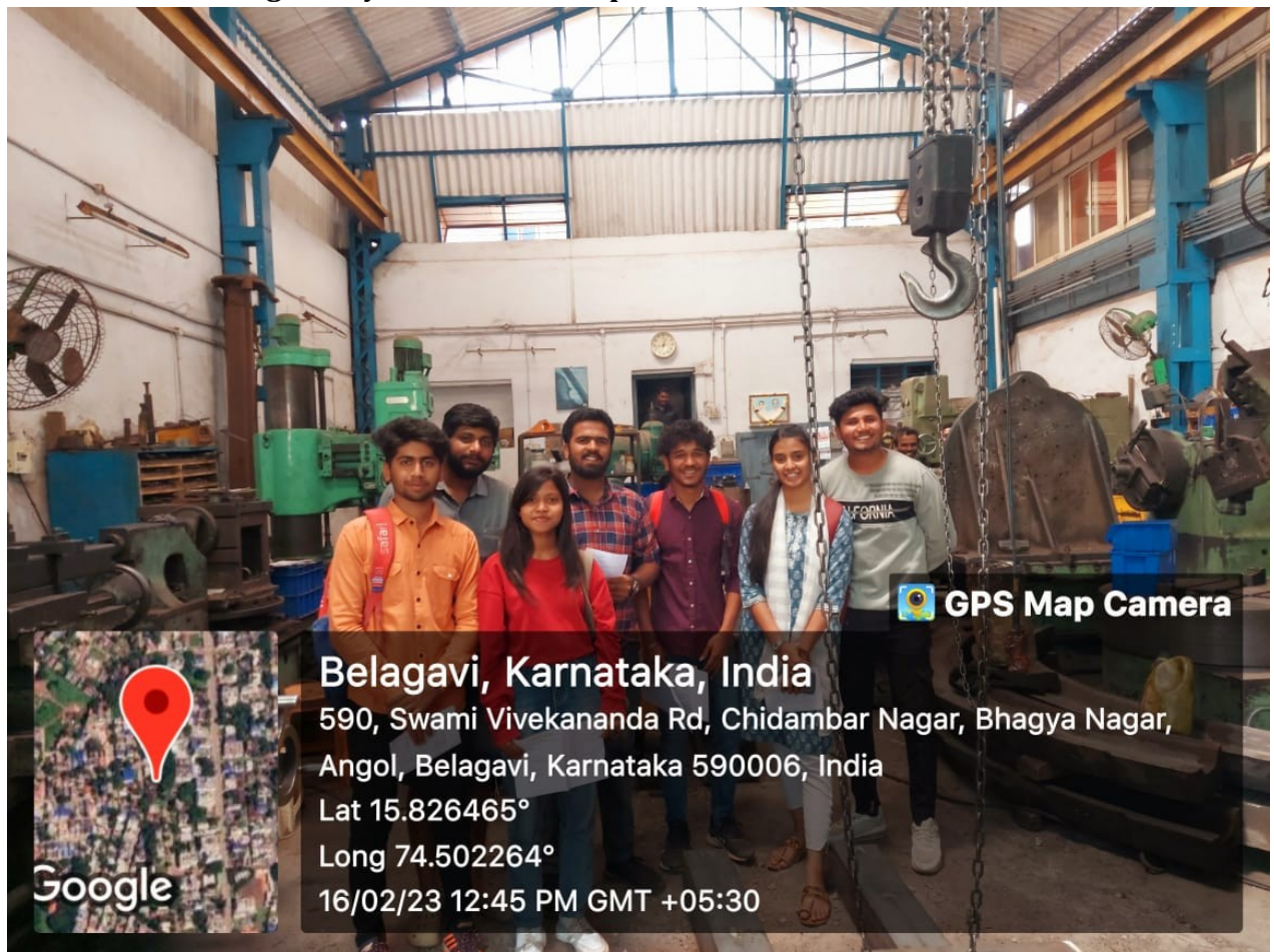
Students conducting survey in MSMEs