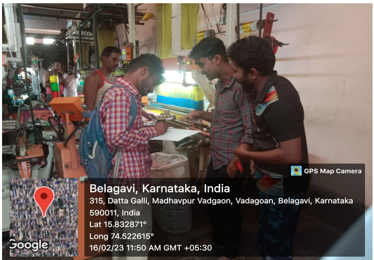
Students interaction with workers and collecting information