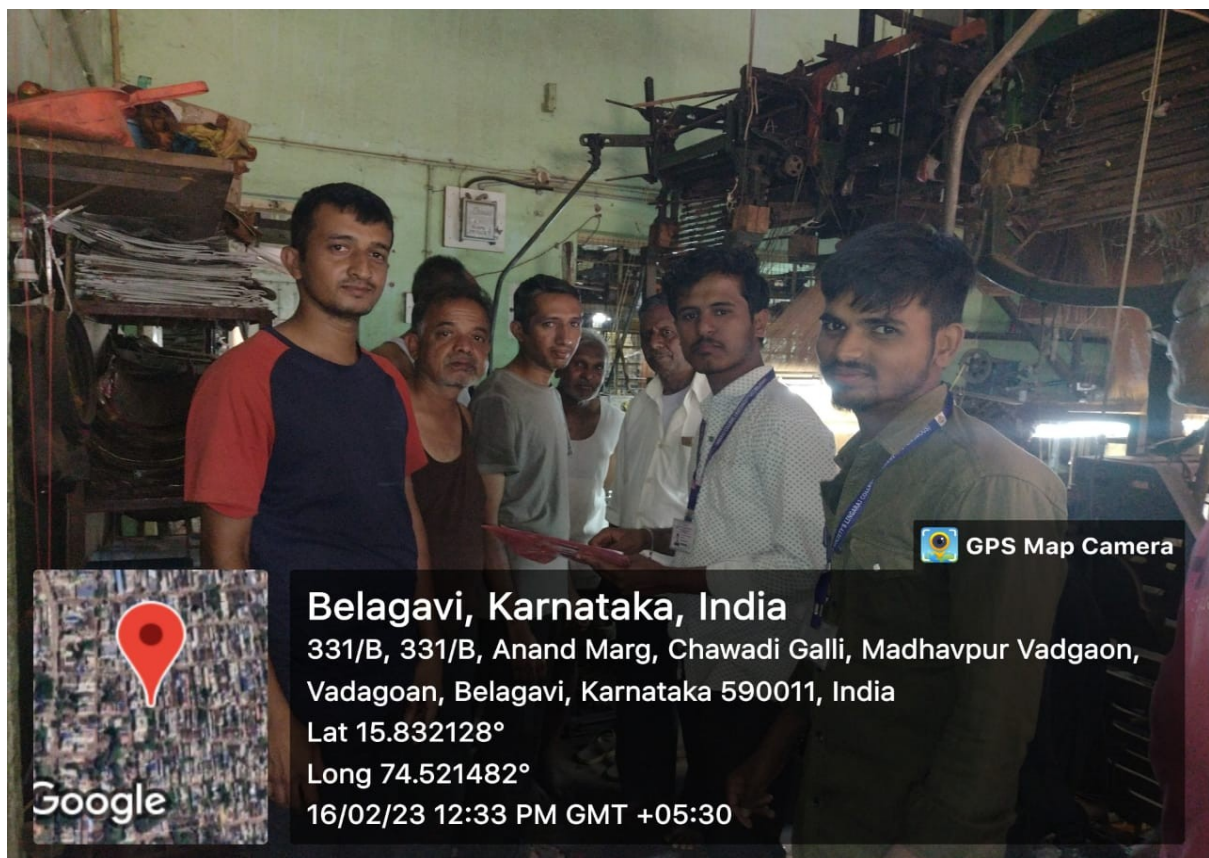
Students conducting survey on Labour problems